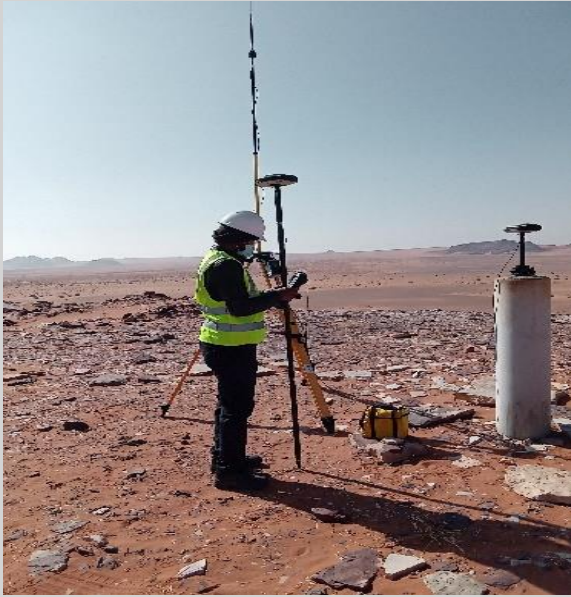
Set up of GPS Base on NEOM site Bench Mark-1 (KSA)