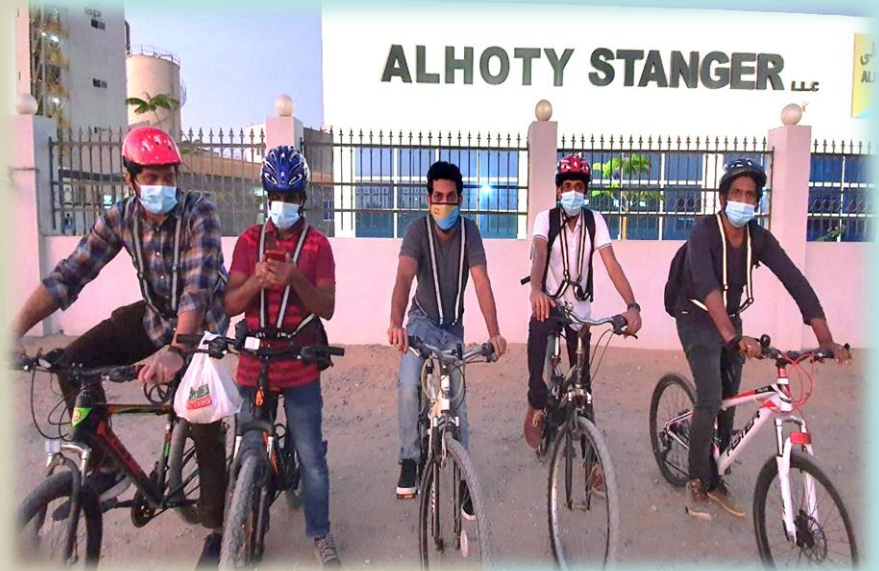
RAK Team departs for their accommodation after a late night shift on New Year's eve.