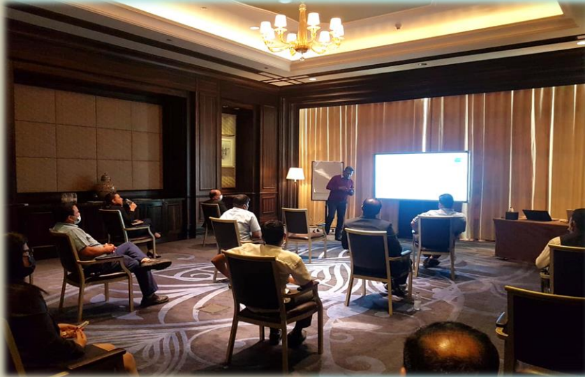
AHSL DGM training a group of Engineers on the nuances of Water Microbiology in Abu Dhabi