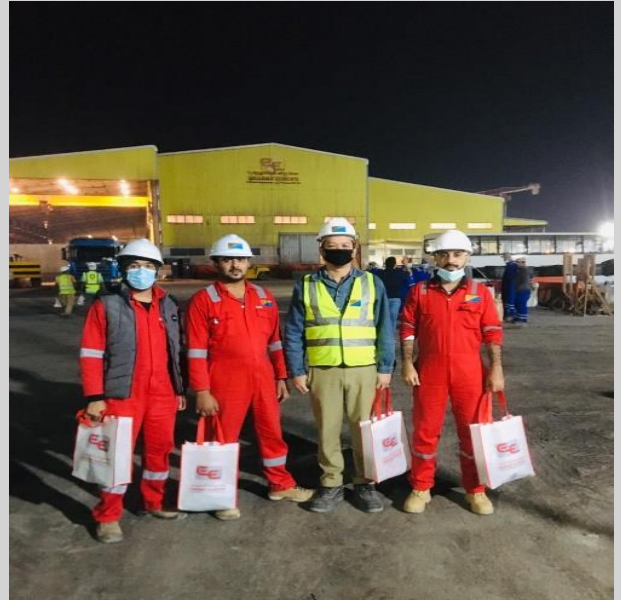
AHSL staff doing the night shift at the Concreting Plant in Abu Dhabi