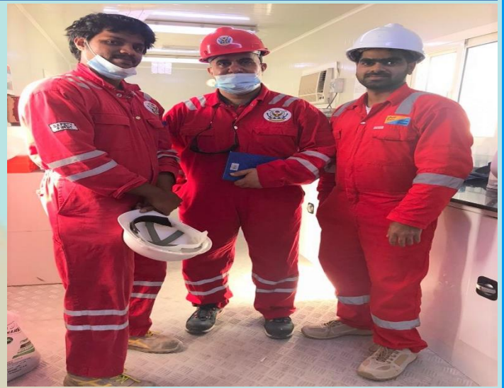
Offshore Team during an HSE audit.