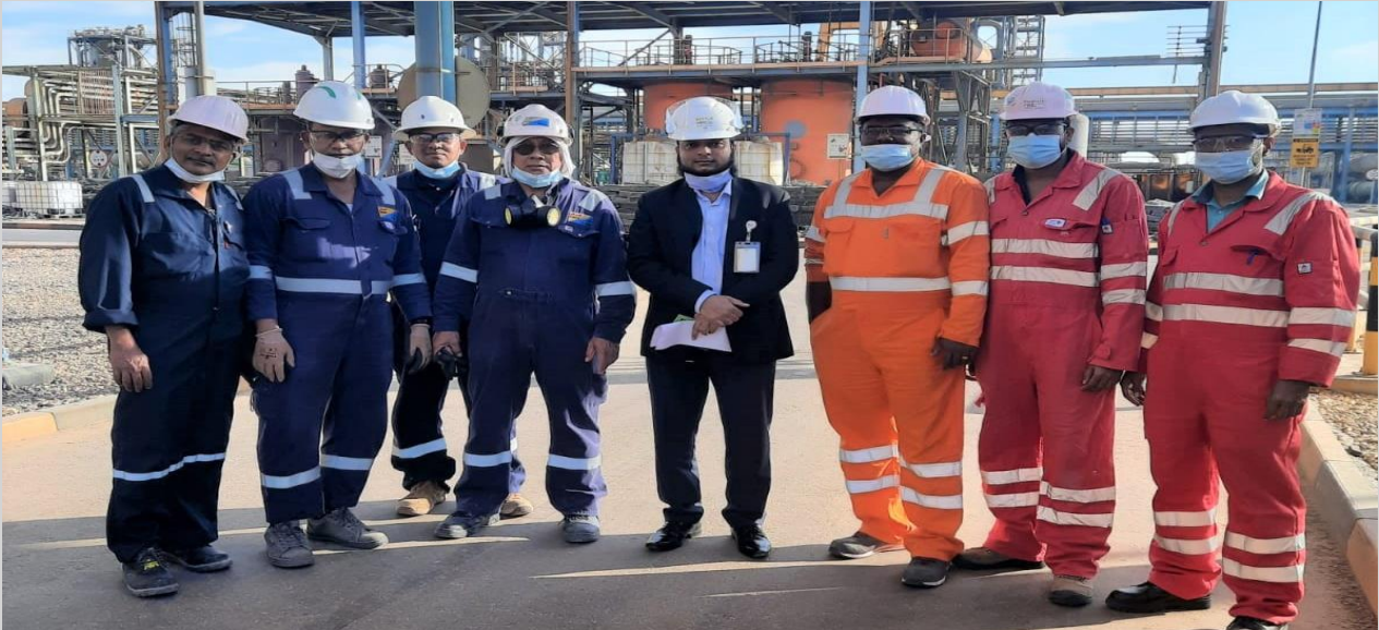
KSA AHSL-ILS Team successfully complete an NDT shut-down project in Bahrain.