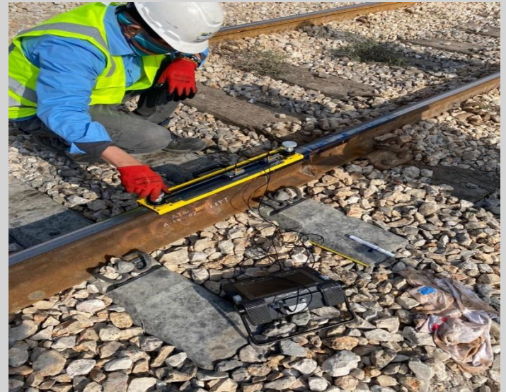
Ultrasonic testing (UT) performed by KSA NDT Specialist Dept. at an ongoing railway project in KSA.