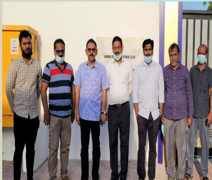
AHSL (UAE) provides IFTAR package to the needy during the Holy Month of Ramadan.