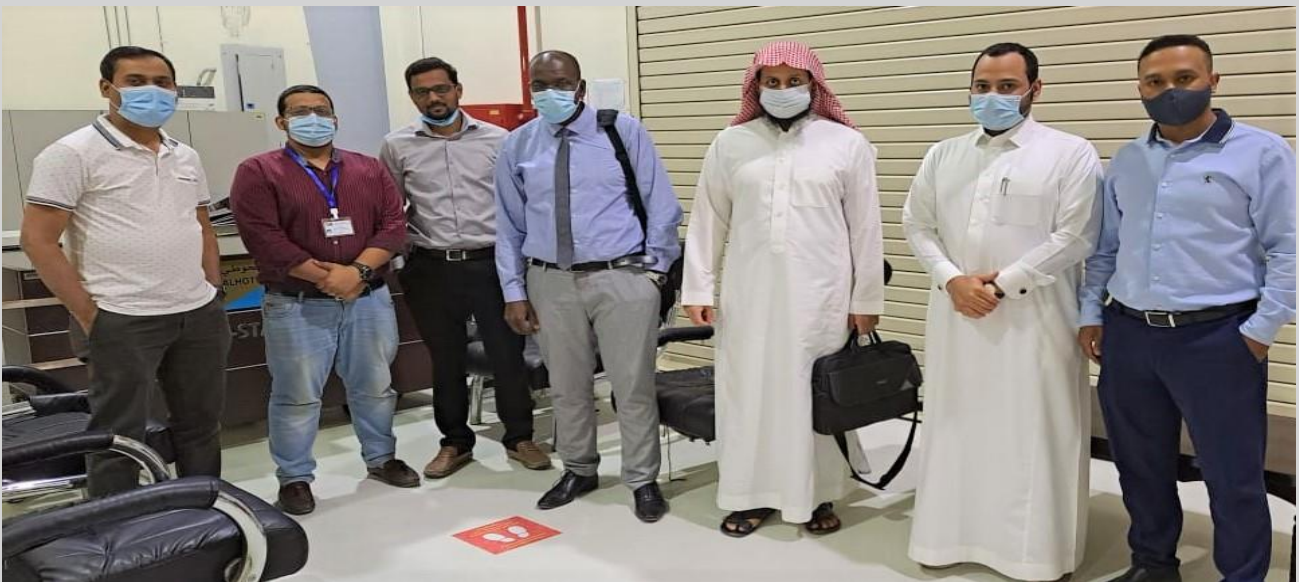
Saudi Accreditation Committee (SAC) audit of Civil Department-KSA.