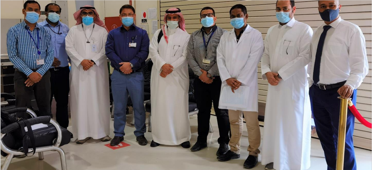
Saudi Accreditation Committee (SAC) audit of Microbiology Department-KSA.