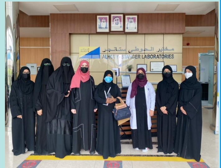
Jumeirah University Students on a short training stint in AHSL-ABU DHABI.