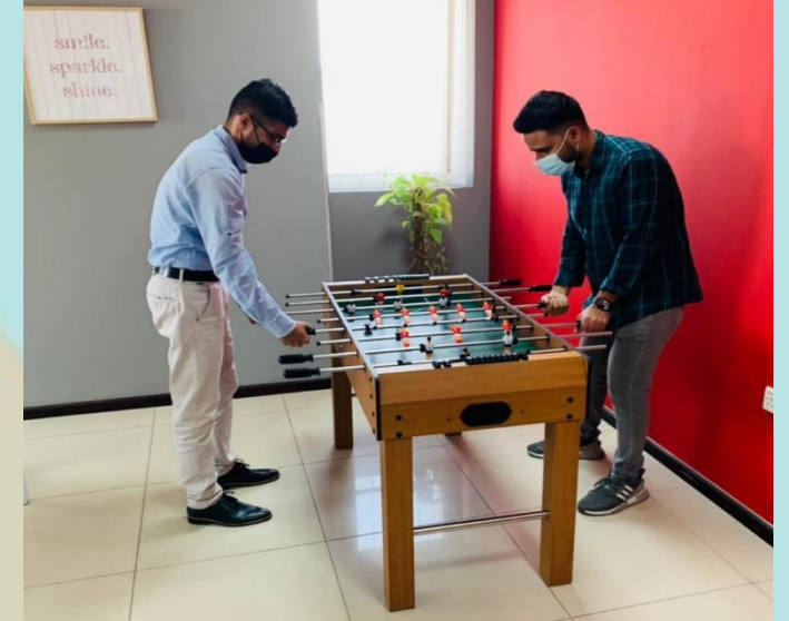
Indoor football table added for staff recreation in the AD lab Dining room.