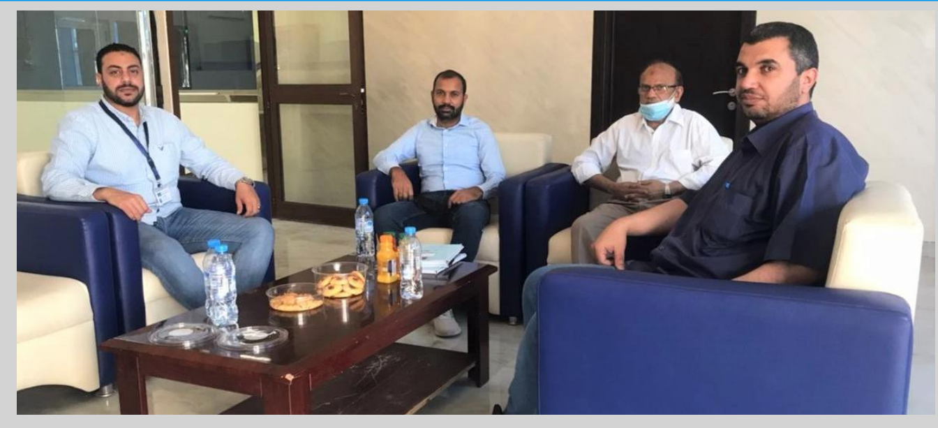
Successful Meeting and lab visit of Client and Consultant representative - AHS new lab facility.