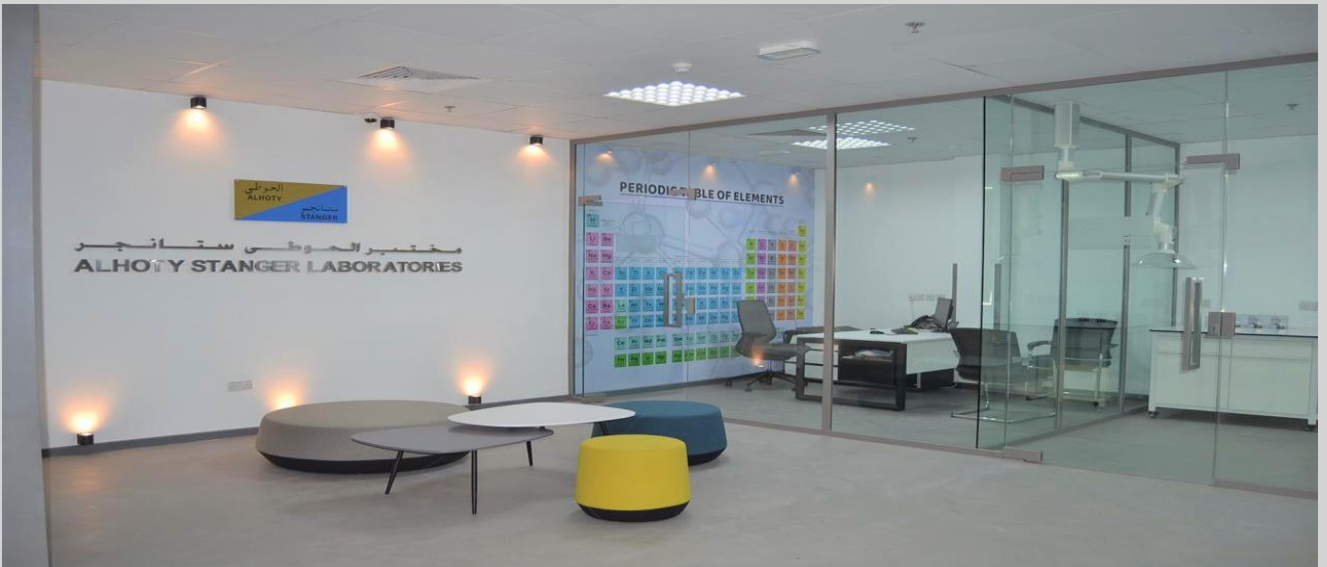
Sneak peek of the new Food Chemistry Lab taking form in Abu Dhabi.