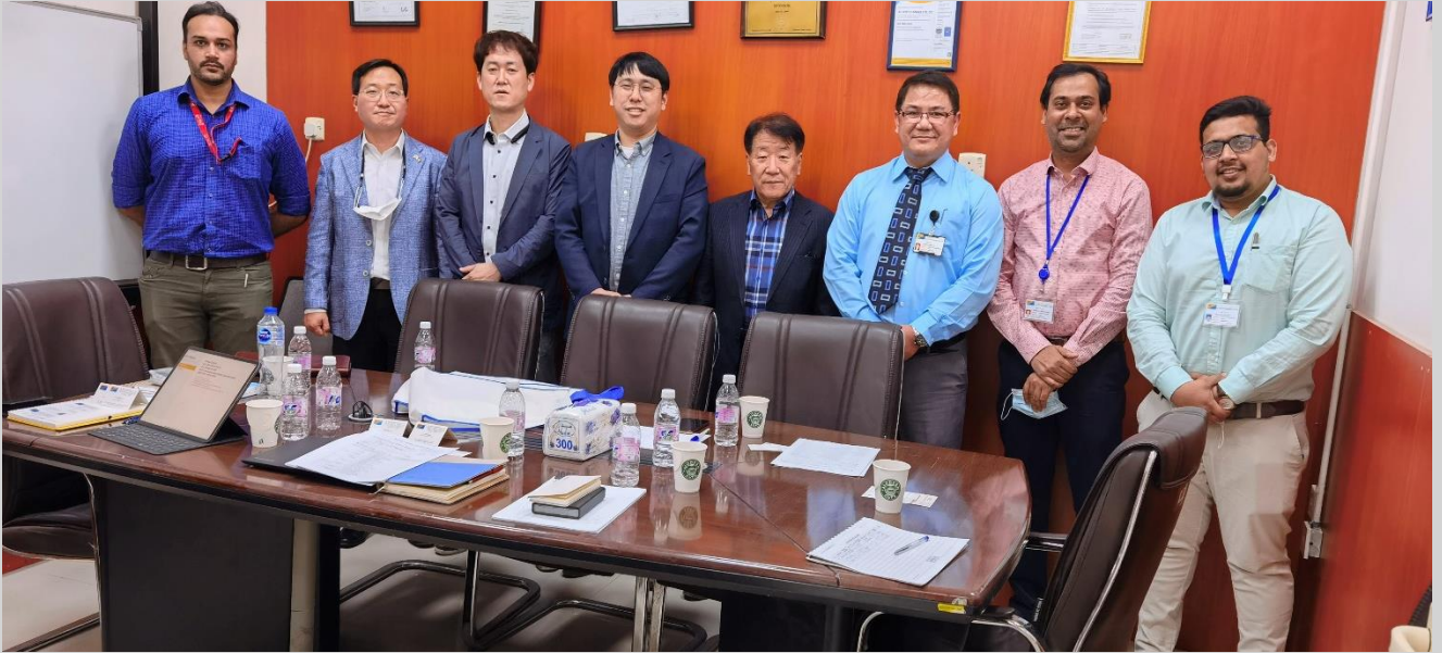
Successful Meeting with a reputed Client at Al Khobar – Head Office.