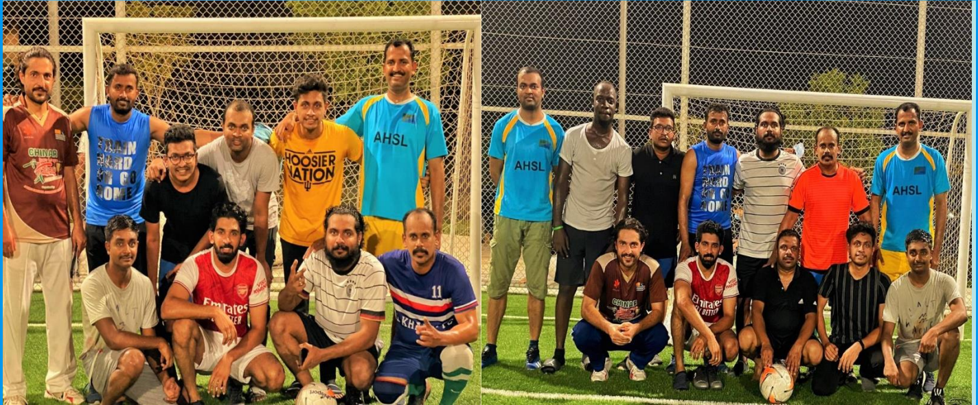
AHSL DXB's Staff Football Team enjoying a game during the EID Holidays.