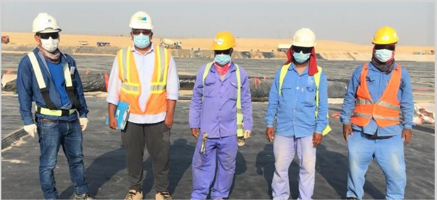
Successful MC Project completion at KSA.