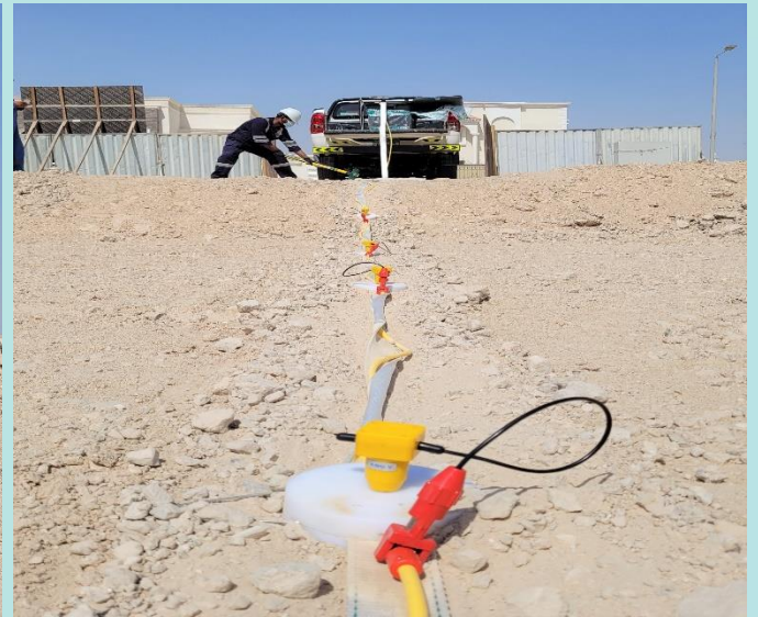
AHSL UAE launches its new GEO-PHYSICAL TEST SCOPE, as part of its current repertoire of Geo-tech tests.