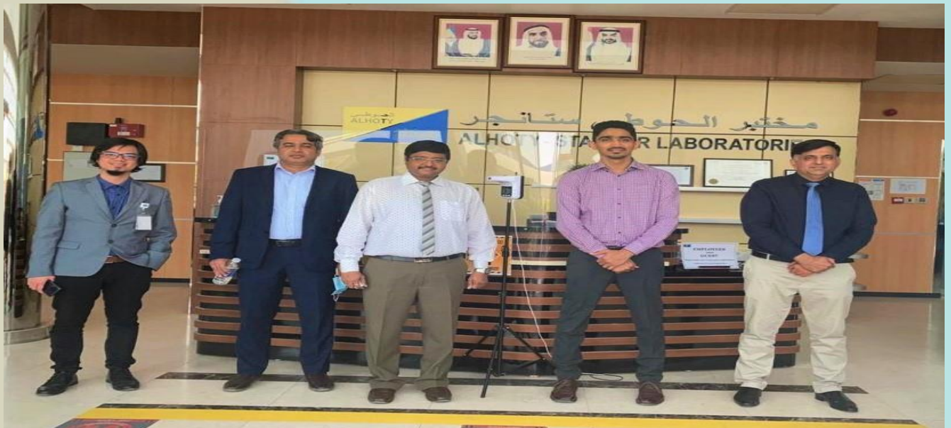
Successful BV Annual QA Audit in our Abu Dhabi Lab.