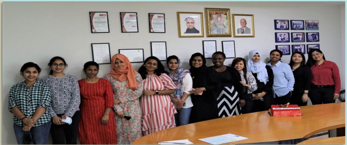
AHSL-AD's, Women's Day Celebration.