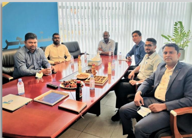
Team RAK Micro being audited by a client.