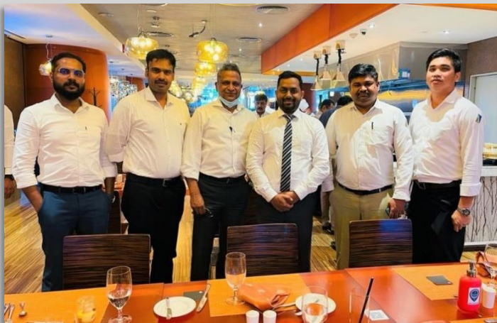
Sales Business Development Team lunch meeting.