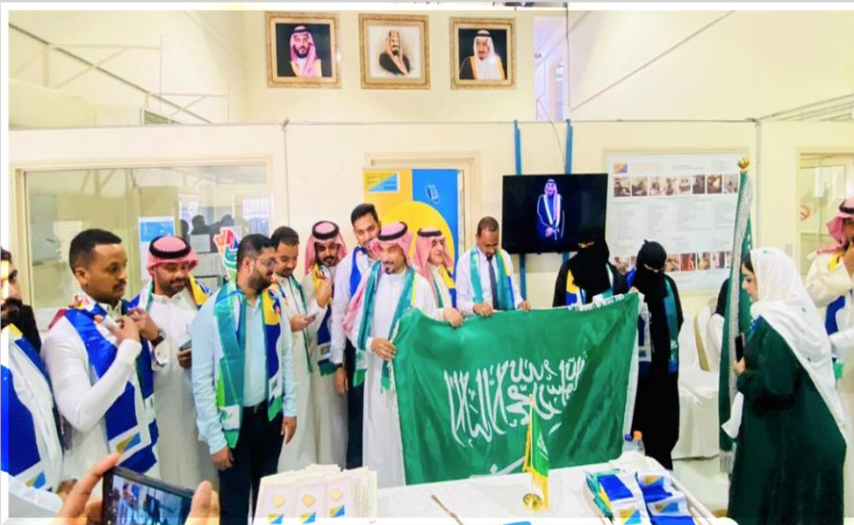
Saudi National Day Celebration at our Head office.