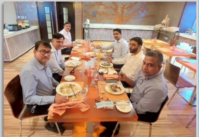
Regional Managers lunch meeting.