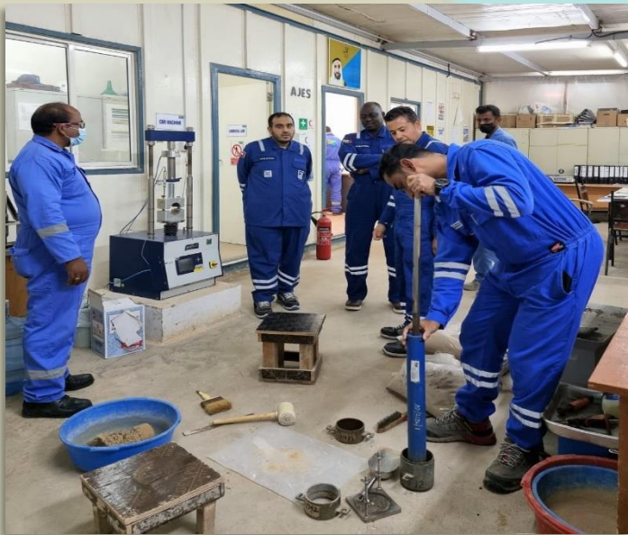
ADNOC top Mgt. Team visited Ruwais Site Lab.