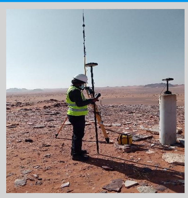
Set up of GPS Base on NEOM site Bench Mark-1 (KSA)