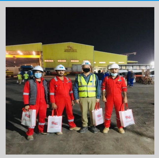
AHSL staff doing the night shift at the Concreting Plant in Abu Dhabi