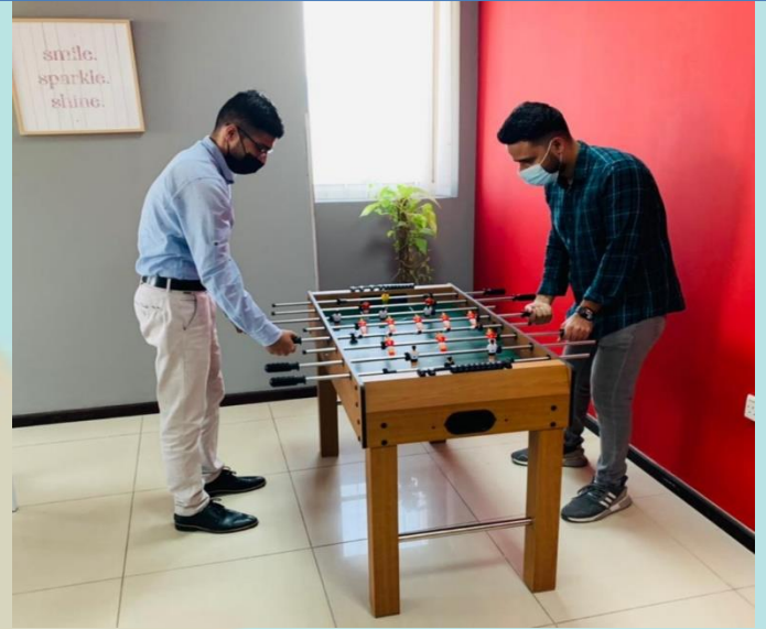
Indoor football table added for staff recreation in the AD lab Dining room.