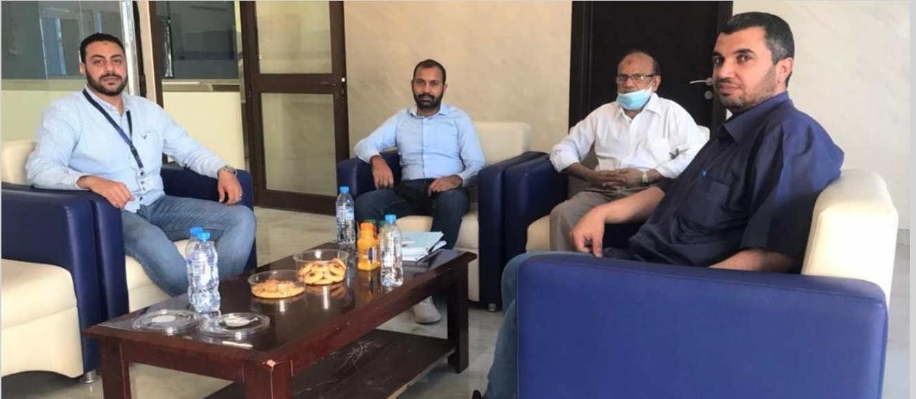
Successful Meeting and lab visit of Client and Consultant representative - AHS new lab facility.