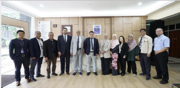
AHS-KSA & ILS-AHS BAHRAIN Management visited SIRIM Malaysia Head office