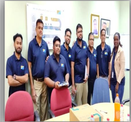
Training/Q&A Session - Accounts Dept. at Dubai lab.