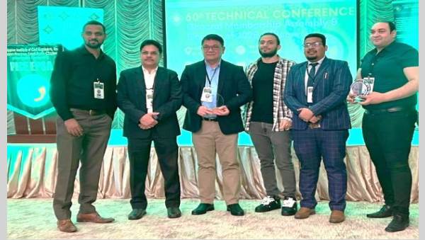
60th Technical Conference of PICE EPSA