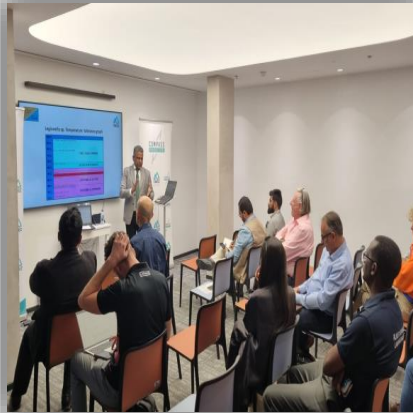
RAKEZ HSE Office, HSE presentation from Al Hoty RAK SEMINAR: INDOOR AIR QUALITY