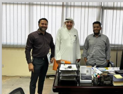
ILS-AHS Team visiting Customer Offices