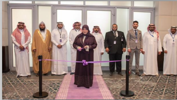
Participation in the Quality in Laboratories Conference