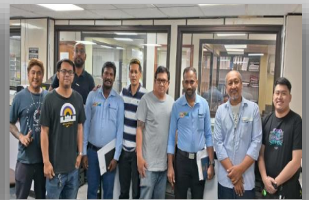
ILS-AHS Calibration team visited Al Hoty Calibration Services KSA for Training