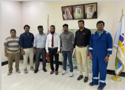
ILS-AHS NDT Department audit from customer BSTS